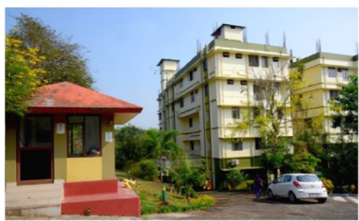
Inter University Centre for IPR Studies, CUSAT

researchers from different universities and research institutions, both nationally and internationally. IUCIPRS aims at facilitating multidisciplinary teaching and research in the area of IPR and related subjects.