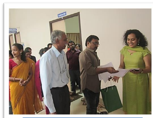
Copyright and film industry conference 2017

V. Students Internship – Six research intern under Women Students of Science and Technology (under KIRAN Scheme of DST) since 2016.