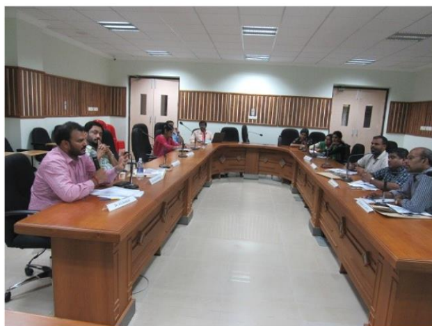
Round Table of Research Institutes for Providing IP Support- 2018