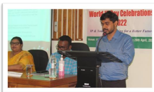
IP day Celebration – IPR chair IUCIPRS- 2022

Government of India has established a Chair on IPR at CUSAT (2003) and is functioning at the Centre to promote teaching and research in the area of IPR. This is currently funded by the DIPP, Ministry of Commerce and Industry, Government of India. SPRIHA Scheme also gives funding for conducting research and seminars.