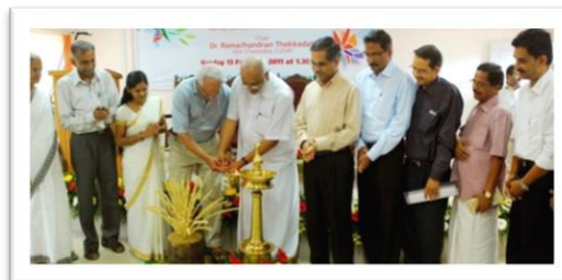
Inauguration of the Centre, 2011

The Inter University Centre for IPR Studies (IUCIPRS) was established in 2010 by the Government of Kerala as an autonomous Centre in CUSAT Campus. The main objective of IUCIPRS is to evolve into a research hub and resource Centre of international repute and to act as a think tank in the area of IPR and related subjects. It aims to facilitate interaction among