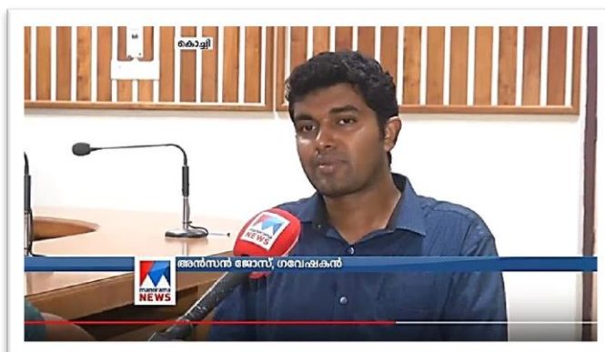
Centre Faculty members at media for sharing their research outcome

Research Working Group for GI Studies is created for attaining this objective with a set of predetermined goals and that will transfer understandings of social reality to the next generation of researchers and policy makers in IP. Research work group on geographical indications has been started in 2017 with key concern to upkeep GI actual producers and assistance them in Legal protection. It also aims at