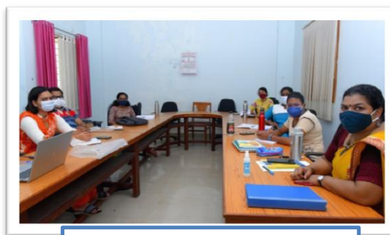
Integrated LLM PhD Class Room. IUCIPRS

(other than law students) in the areas of: Patenting Inventions: Practice and Access to Tools; Overview of Patent drafting; IP and Management. As of date, awarded 40 Master's Degree in LLM (2016-21).